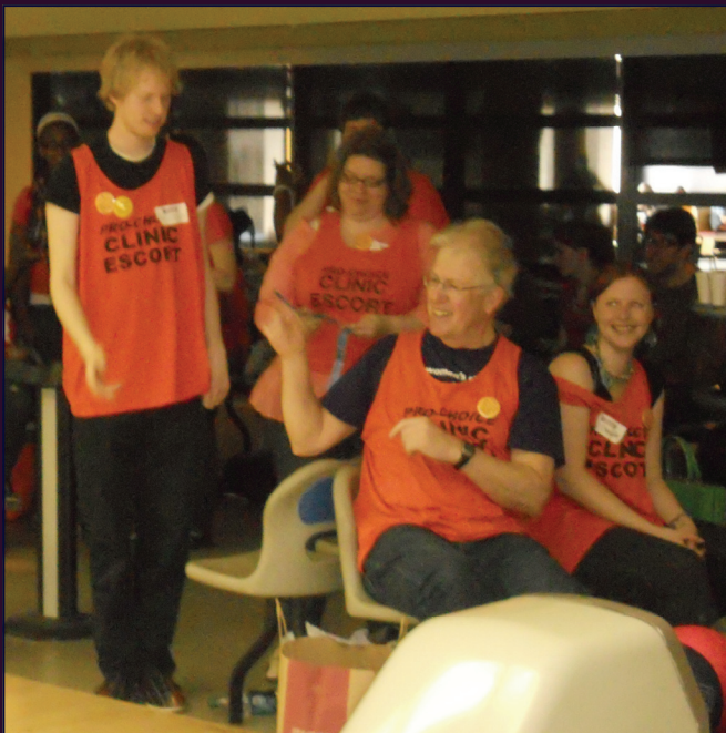
Washington Area Bowling Alley Defense Task Force

In May, our community allies DC NOW, the Younger Women's Task Force-DC, and the Women's Information Network hosted a comedy night at Madam's Organ to benefit DCAF. We ended the fiscal year in June with a thank-a-thon evening and volunteer appreciation gathering to thank everyone who had contributed their time, energy, and money toward DCAF's work over the year. We had a great time working with all of these groups and individuals and are excited to collaborate with them as well as our other allies in the area moving forward into the coming years.