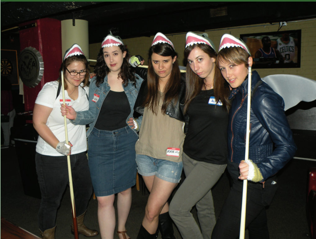
Team “The Pool Sharks” won the costume contest

Thanks to the hard work of all our amazing fundraising volunteers, these events were a huge success, allowing us to continue helping local women and girls in need.