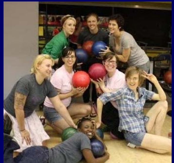
The Visions in Feminism Collective was one of many DC organizations that bowled with us!

The Washington Area Clinic Defense Task Force's Repro Rights Roellers Team raised $1,465 to take the top fundraising prize. Prizes were also awarded for highest individual fundraiser, best team spirit, highest team bowling score, and lowest individual bowling score.